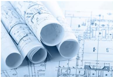
CAD and Technical Drawings

These uniquely versatile scanners capture the sharply defined line detail in technical documents and maps required for AEC, CAD and GIS combined with the highly accurate color reproduction and copying required for graphics and photographic documents – at a price you can afford.