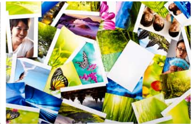
Graphic Art & Photographs

All SmartLF scanners are available in three affordable specification levels; monochrome, color and express color, (m, c, e). m and c models can be easily upgraded via unique Email process if requirements change.